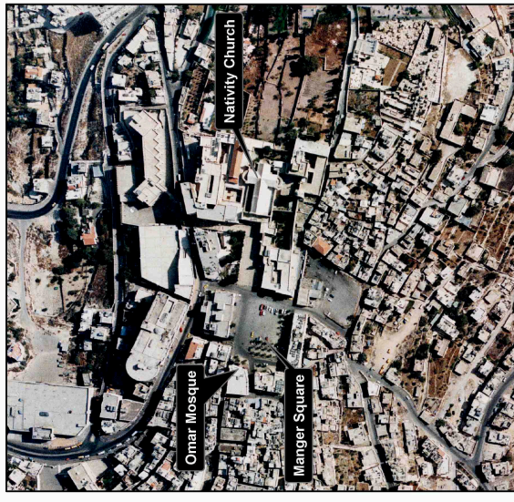
MANGER SQUARE, BETHLEHEM Aerial Photo, October 2002